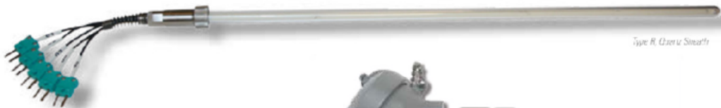
Type R, Quartz Sheath