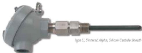
Type C, Sintered Alpha, Silicon Carbide Sheath