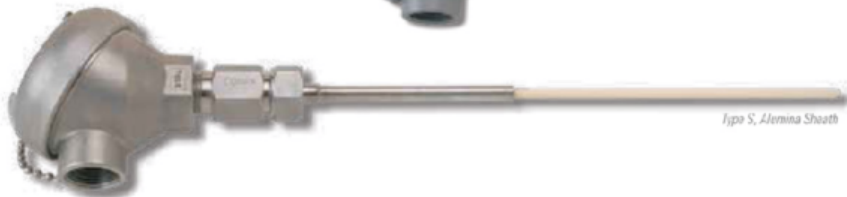
Type S, Alumina Sheath